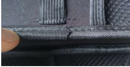
Bad Inside Stitch