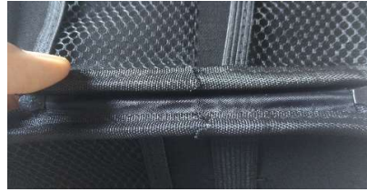
Unstraight Zipper Alignment